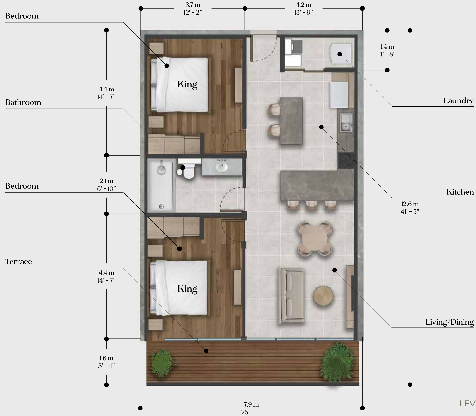
LEVEL 3 - KEY PLAN