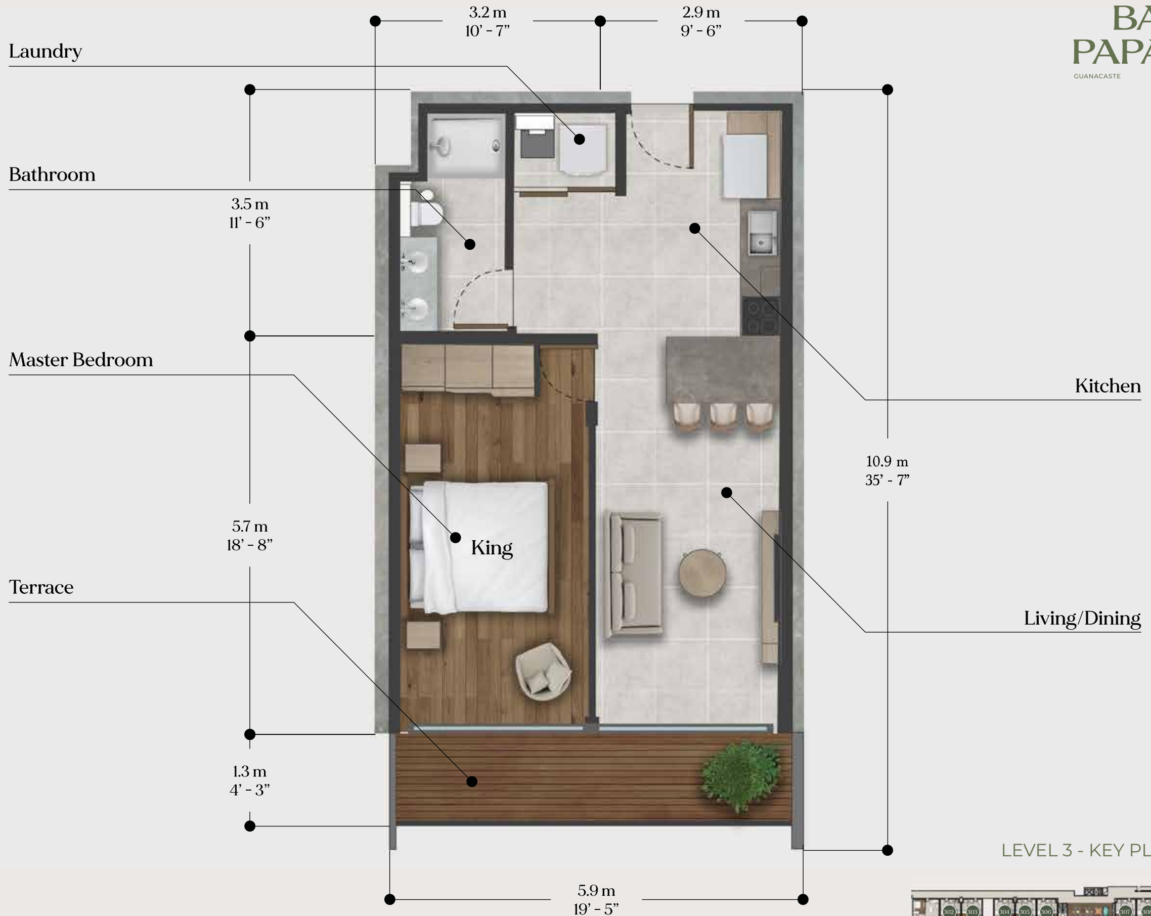
LEVEL 3 - KEY PLAN